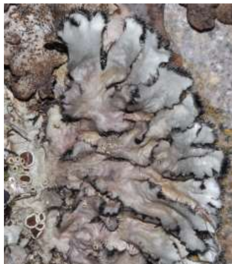
Lichen Reference Photo